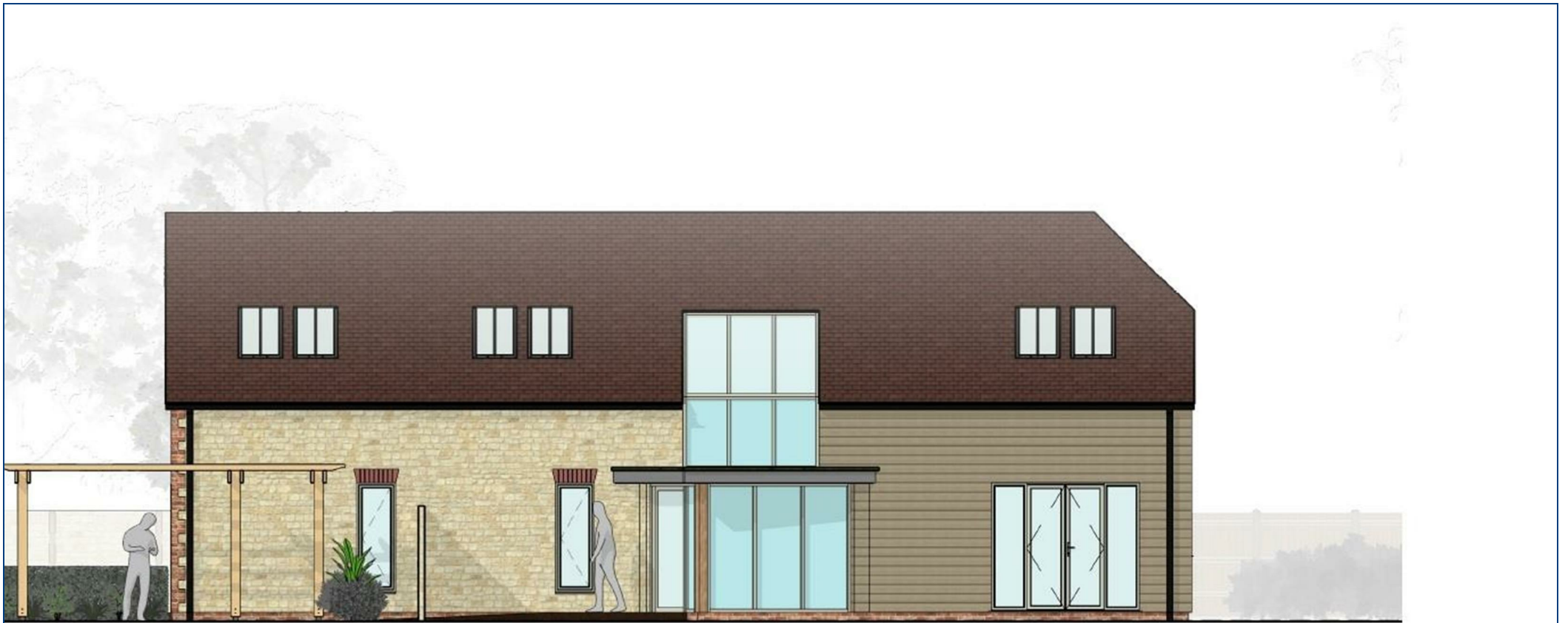
FRONT ELEVATION - PROPOSED